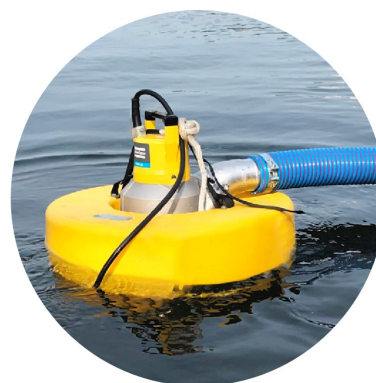
Pump raft 25 - 55 Pump rafts 25 and 55 consist of a float ring, a strainer and a tightening strap.