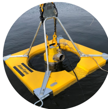
Pump raft 80 - 170 - 260 - 400 - 550 The pump rafts 80 up to 550 consist of a modular system where preselected models meet the required lifting capacity for pump models D60 up to D100. For other WEDA sludge or slurry pumps, check the weight of the pump and choose a suitable pump raft system.

rev 0 2021.07 - Subject to modifications without prior notice